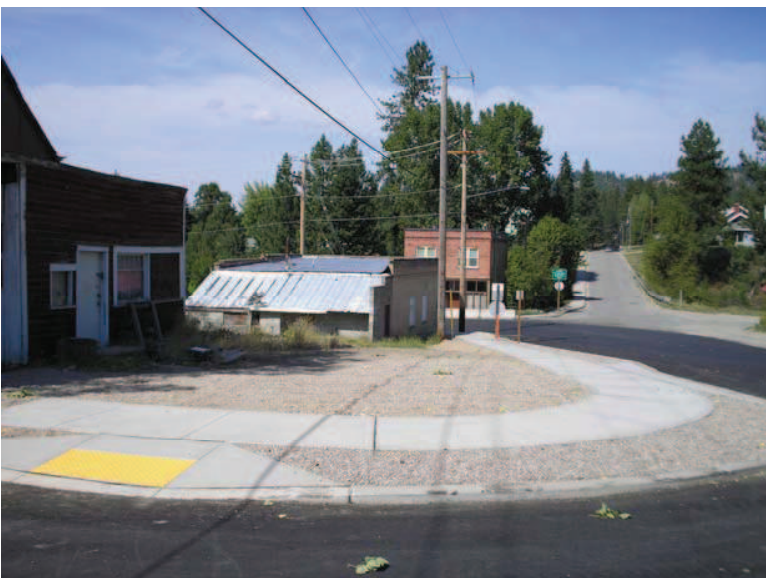
The project site after construction