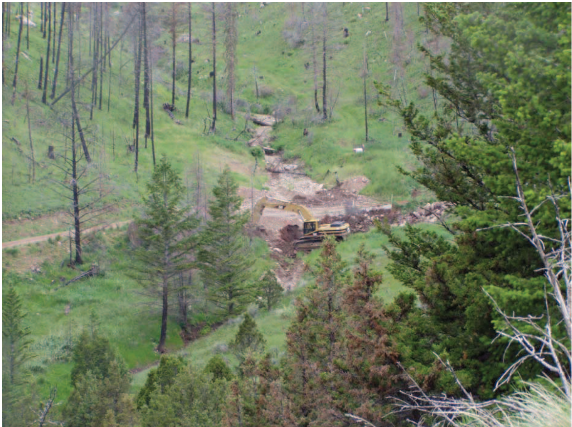
Crooked Creek Project

This project, for the USDA Forest Service at Custer National Forest in Montana, includes constructing erosion control structures to prevent erosion and loss of road. The project consists, in part, of ten erosion control structures, five structures at each of two sites. Two primary control structures at each site shall be comprised primarily of micro-pile (excess rail steel) and rock fall netting as the reinforcing structure. Two secondary control structures at each site shall consist primarily of rock fall netting anchored with soil/rock anchors. The remaining tertiary erosion control structure at each site consists of soil nails (#11 rebar pins) driven perpendicular to the stream channel. Approximately 1,700 cubic yards of material requires removal along the road prism and stream channel to enable installation of the erosion control structures. Approximately 600 cubic yards must be hauled approximately 1.4 miles from one site to the other to balance the cut and fill.