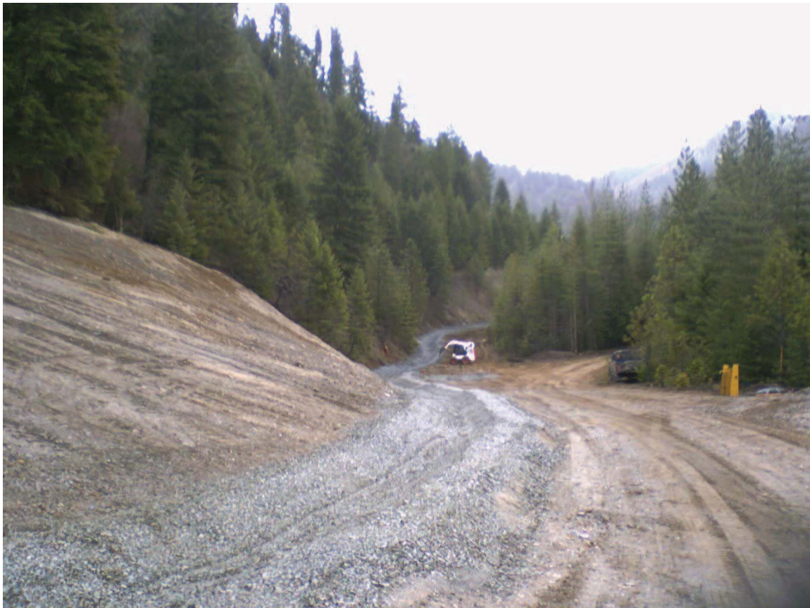
Completion of Phase I at the Golconda site

Work for this project was performed in the early spring months, as per contract requirements. The project was completed ahead of schedule. At the request of the client, FC evaluated the feasibility of a river crossing to maintain site access. A change order was issued for installation of a bridge for site access.