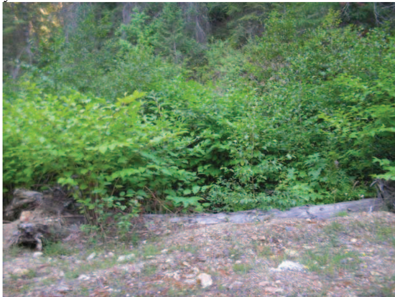
Japanese Knotweed prior to injection.

This project entailed treatment of invasive species located on USFS land. General treatment of species was utilized with spray rig and handgun. Specialized treatment was performed on Japanese/Bohemian Knotweed. Ferguson Contracting injected over 5000 stems of Knotweed in these project areas, this method is extremely labor intensive. Managing this project area was of utmost importance as the herbicide labeled for this does has an annual use rate and species were present in riparian areas. The project areas were later seeded and planted with native species by the Prime Contractor.