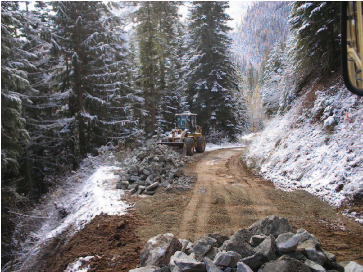
John Bobtail Road Repair

This Idaho Panhandle National Forest project consisted of repairing damaged drainage areas along two separate Forest Service roadways located in the Coeur d’Alene River Ranger District (site 434-13.8 and site 978-0.4). Project involved clearing necessary debris and vegetation from the work sites and removing and replacing existing culverts. Ferguson Contracting excavated material on the road surface and cut slope and used to fill the damaged sections of road. Tasks included armoring the road fill slope with rip rap material.