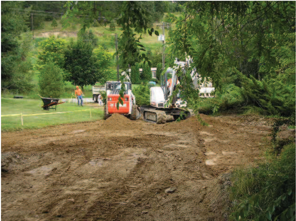
Coeur d'Alene Basin Property Remediation

FC excavated and transported contaminated materials from the project sites with subsequent hauling and placement of "clean" materials. Tasks performed were general grading, backfilling with clean soil and / or gravel, sod/reseed areas backfilled with growth media. This project involves a base year contract with three option years