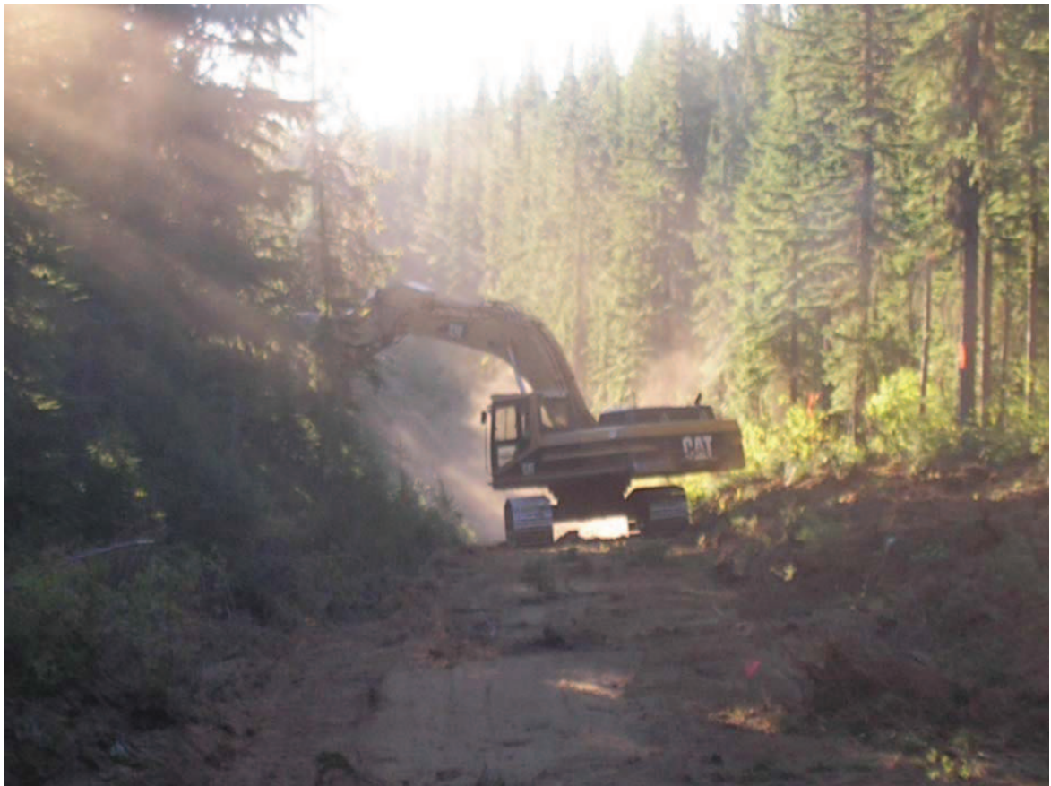
Placer Road Improvement

This Idaho Panhandle National Forest project consisted of reconditioning Road 330, reconstruction and relocation of a spur road Rd 330A, and the closure of Road 2376 located in the Coeur d'Alene River Ranger District. Project involved clearing necessary debris and vegetation from the work sites. Ferguson Contracting excavated material on the road surface and cut slope and used to fill the damaged sections of road. Tasks included run-off ditch construction.