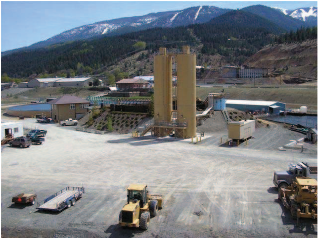
The Central Treatment Plant in Kellogg, Idaho

Ferguson Contracting's primary project during the past five years has been operation of the Central Treatment Plant, a 2000-gpm lime treatment plant that has been in service for over 30 years and has recently been significantly upgraded. The CTP includes: two lime silos and slakers, a lime slurry tank, a lime system control room, a rapid mix tank (sludge recycle tank), an aeration basin (reaction tank), flocculent addition, a 236-foot-diameter clarifier, a secondary settling basin, a new control room, a back-up electrical generator, a lined water storage pond and pumps, and a sludge storage pond.