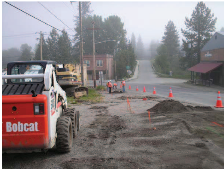
The Springdale site at the beginning of the project

This City of Springdale project consisted of construction of approximately 1,200 lineal feet of sidewalk with multiple ADA ramps and vehicle ramps. Traffic curb installation, roadway surface preparation and landscape/surface preparation were all performed in conjunction with this activity. Work was considered fast-track and required early completion in order to allow construction access for follow-on work. This work was performed along the main street of the town and all businesses were kept open at all times.