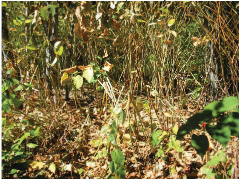
Japanese Knotweed after injection treatment