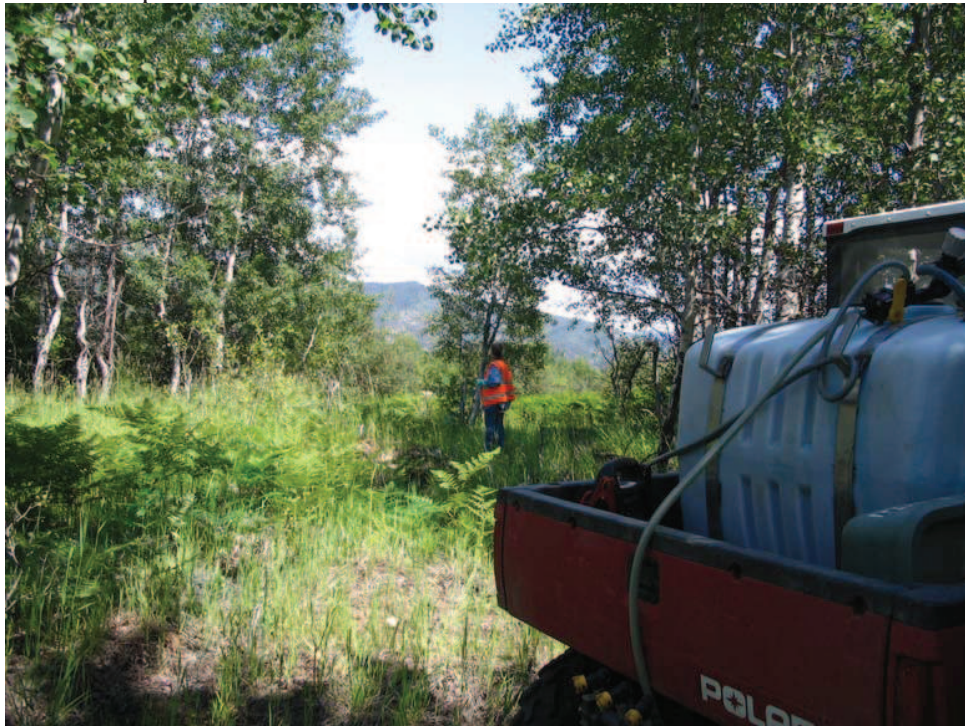
Bunker Hill Weed Spraying

This project, for the U.S. Army Corps of Engineers involved mapping, treatment and removal of noxious weeds present on 1,100 acres of the Bunker Hill Site. Methods of treatment involved dividing the project site into three areas; right-of-way, meadow-like areas, and terraced areas. Several areas were extreme terrain, and required workers to hike with backpack sprayers. Project included the application of a solid, pellet –formed fertilizer on variable terrain present on site.