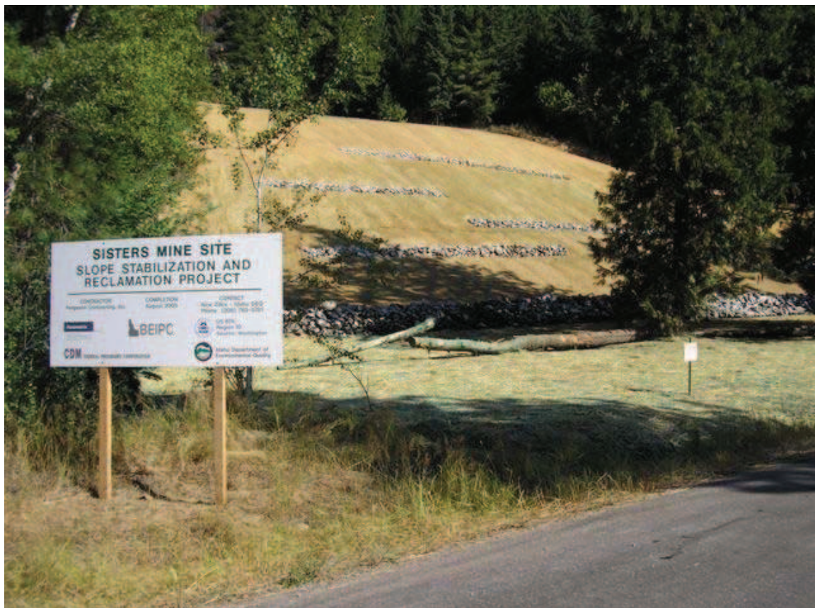
Sisters Slope Stabilization at completion of project

This Idaho Department of Environmental Quality project consisted of recontouring a mine tailings pile and placing a topsoil cap. The soil was then hydro-seeded and a biodegradable geo-grid was installed. The project was unique in that it was a former “hill climb” used by local residents. Riprap barriers were installed into the hillside in a staggered fashion to restrict future access. This project entailed regrading work, contaminated materials handling, soils capping, hydro-seeding and equipment decontamination. The start date of this project was fast-tracked at the request of the client and was performed simultaneously with ongoing projects in Washington, Idaho and Montana. This project was completed within budget with no change orders requested.