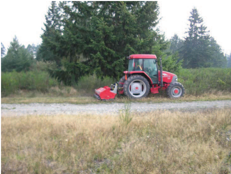
Mowing and Slashing Project-Ft. Lewis

This project, for the U.S. Army Corps of Engineers involves mowing and removal of Scotchbroom and brush present on 2800 acres of the Ft Lewis Military Base, near Olympia, WA. Areas consist of grasslands, open landscapes, with flat to steep slope. These tasks are performed by a subcontractor.